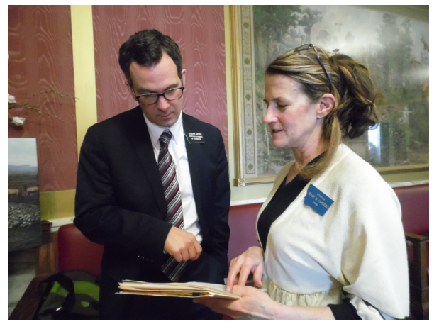
Glenn Oppel catches up with Sen. Mary Caferro (Helena) on health care legislation.

SB 173 would have moved the obligation for the $49 million Old Fund liability to current policyholders in the Montana State Fund (MSF) and negatively impacted MSF's ability to pay dividends or potentially lower rates. SB 173 would have violated current law, which requires that any MSF monies to be used only for claims incurred after July 1, 1990. In sum, the bill would have negatively impacted current policyholders, which are most of Montana's small businesses. SB 173 went to a free conference committee where funding to eliminate a large portion of the Old Fund liability was stripped out. The free conference committee report was rejected by the House (3-97) but adopted by the Senate (26-24), therefore the bill died in the process. These votes are utilized for this review and are worth 3 points.